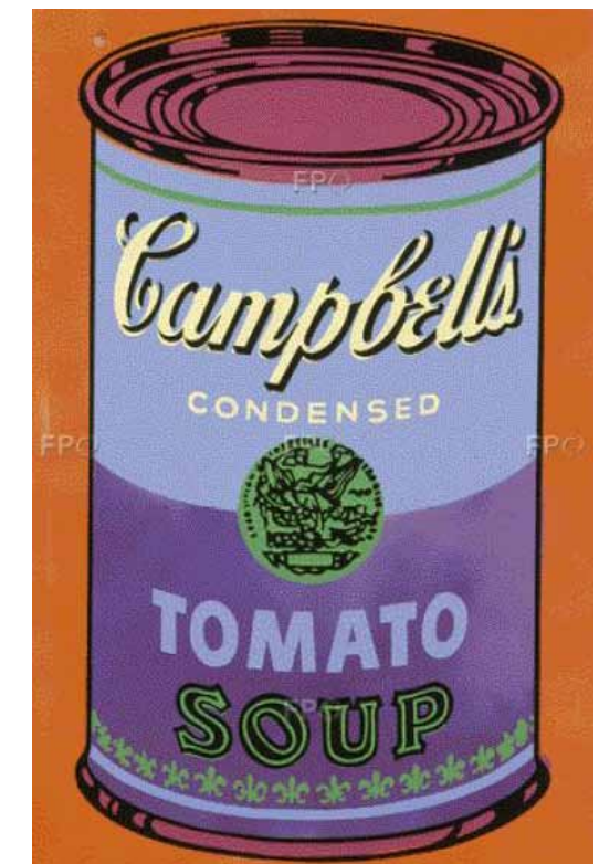
Fig. 19. Campbell's Soup by Andy Warhol (1928–1987), 1965. Acrylic on canvas, 36 by 24 inches. Milwaukee Art Museum, gift of Mrs. Harry Lynde Bradley.