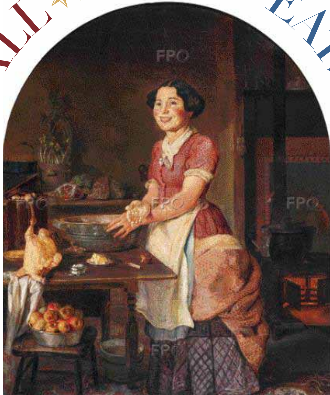
Food and the American imagination in Chicago