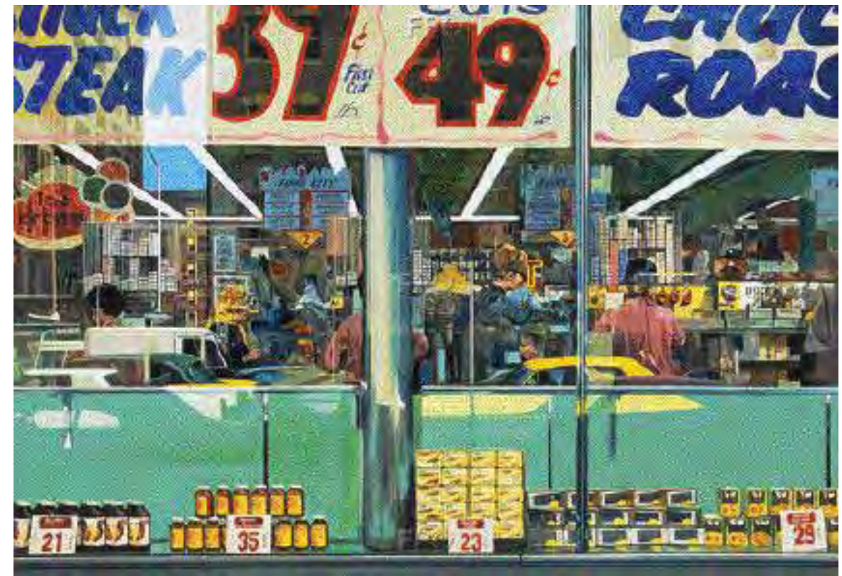
Fig. 17. Food City by Richard Estes (1932–), 1967. Signed “TK” at TK. Oil on Masonite, 48 by 68 inches. Akron Art Museum, Ohio.

In an appreciation published about Fisher in 1990, James A. Beard said, "For an art as transitory as gastronomy there can be no record except for a keen taste memory and the printed word." To that, the Art Institute of Chicago has added the visual realm.