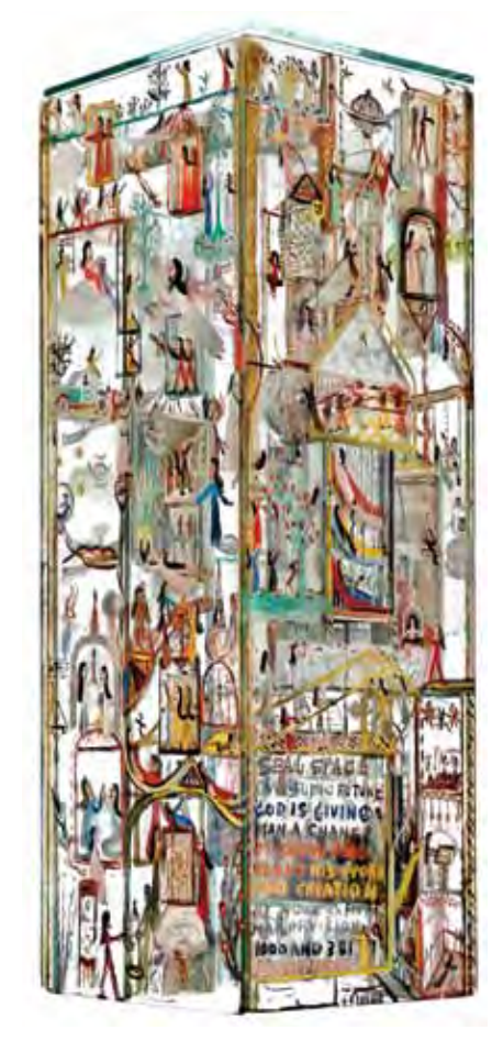
Fig. 4. Seal Space Dwelling (number "1000 and 381") by Howard Finster (1916– 2001), before 1984. Paint on glass, mirrors, and found materials; height 24 ½, width 8, depth 8 ½ inches.

Thoughtful and precise, Blanchard has a way of penetrating a piece, diving beneath its superficial attributes to gauge its emotional essence. Of Bartlett, he says, "He is challenging but also true and deep. We recognized his work as unique, an individual expression that is, in fact, artistic."