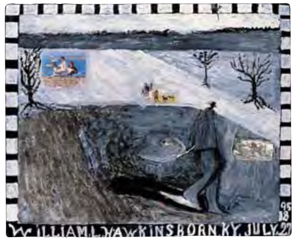
Fig. 10. Dust Bowl Collage

by William Hawkins, 1989. House paint and collage on masonite, 39 1/4 by 48 inches. American Folk Art Museum, Blanchard-Hill Collection, gift of M. Anne Hill and Edward V.