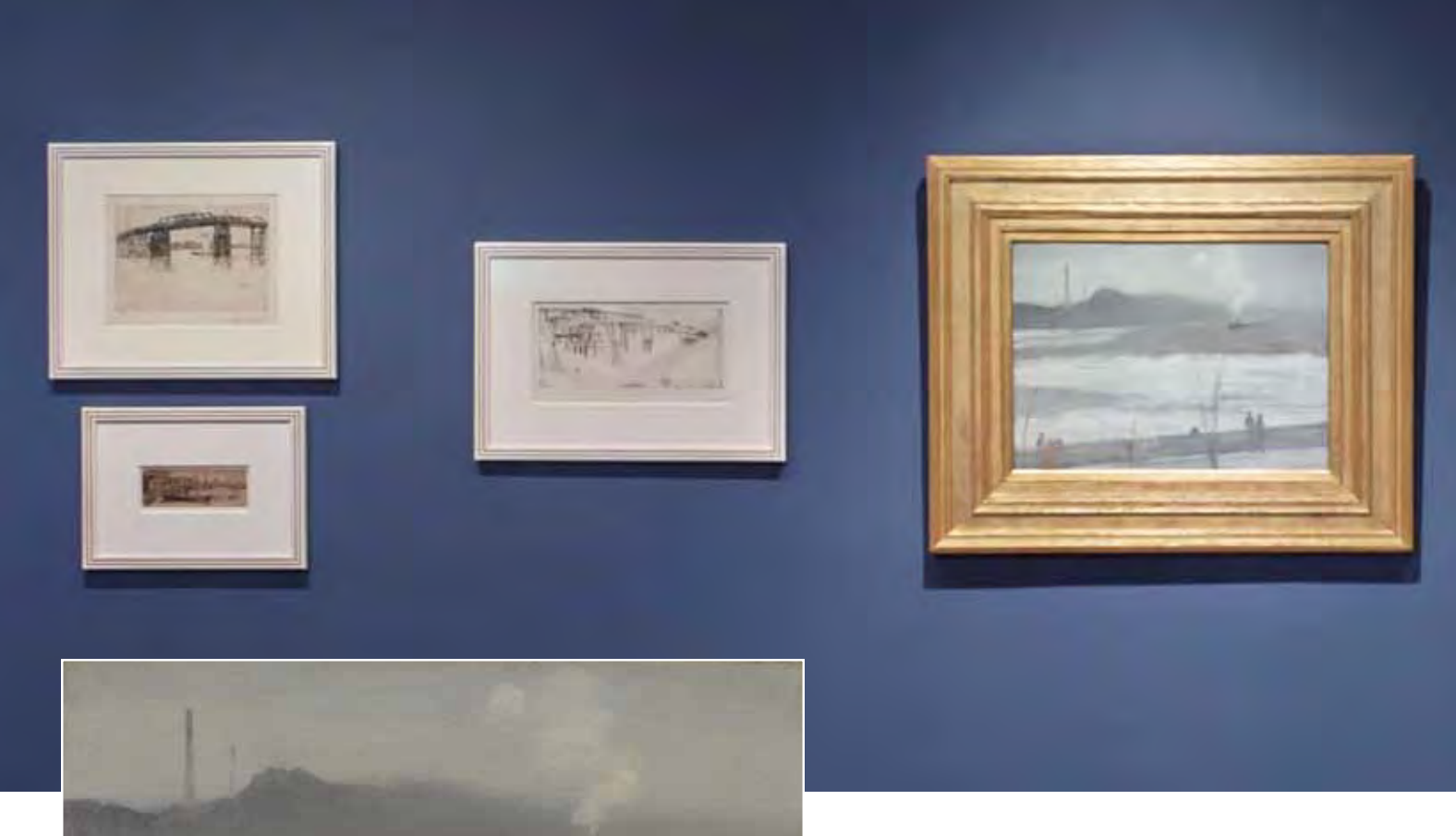
Fig. 14. Chelsea in Ice by Whistler, 1864. Oil on canvas, 17 3/4 by 24 inches. The painting is from a series of impressionistic renderings of the Thames River that the artist created after he settled in London.

adds, "We want children, some of whom may be the first members of their families to go to college, to look out at the campus and say, 'Wow, I could come here some day."